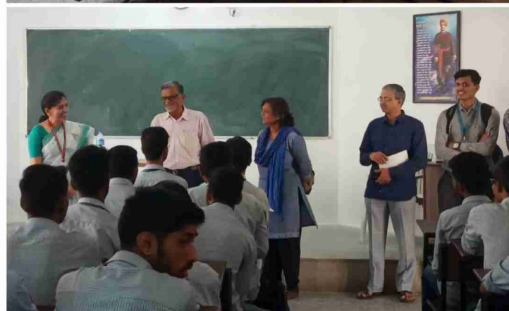
Super Campus demonstration