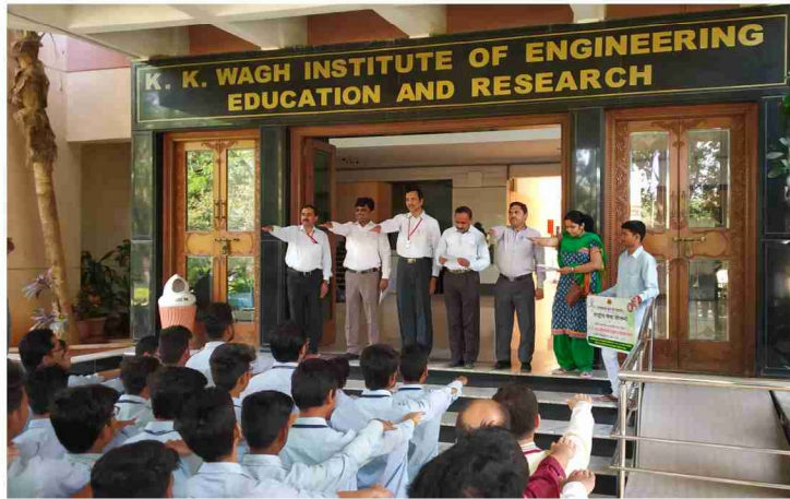
Oath on Tobacco free India