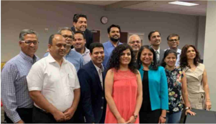
Hon Trustee and Principal along with alumni during alumni meet