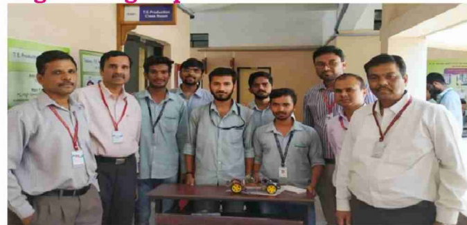
Mini Project Exhibition by Production Engineering department