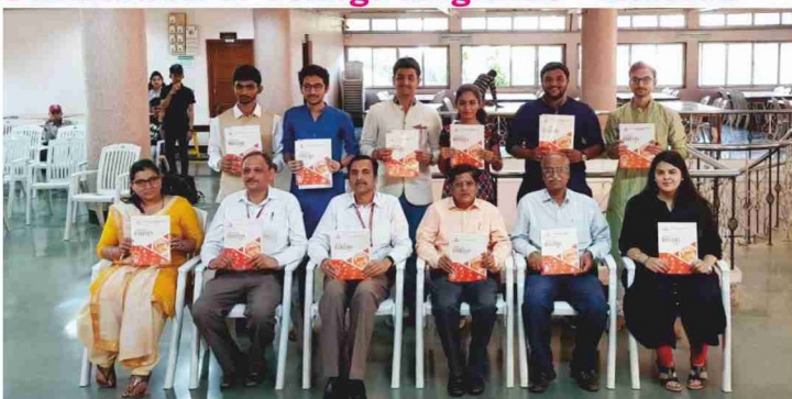
Release of College Magazine- Horizon

Karmaveer Kakasaheb Wagh Institute of Engineering Education and Research's Annual magazine ‘Horizon 2019’ has been published at