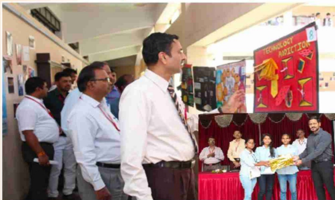
Poster presentation competition