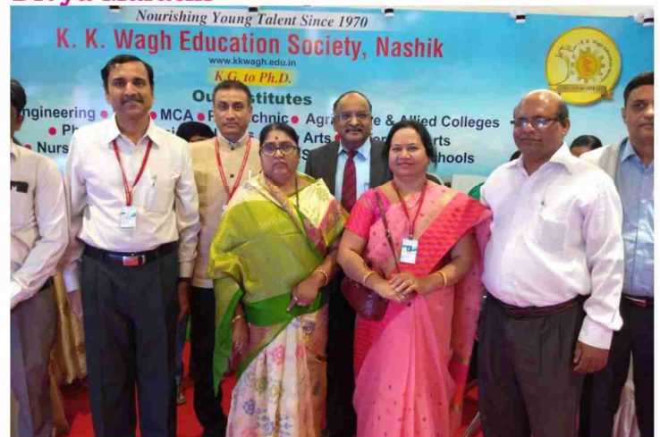
Visit of Hon Mavor of Nashik to our stall in Career Fair