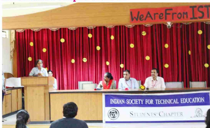
Farewell function of ISTE Student Chapter