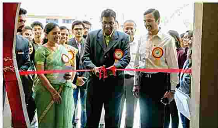
Inauguration of ITiazza-2018

hands of Chief Guest in valedictory function. Total 388 students from different Institutes had participated in the various events of ITiazza-18.