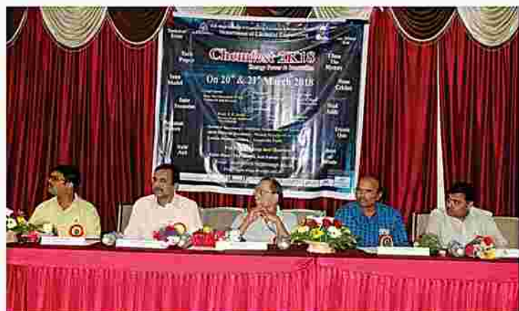
Inauguration of CHEMFEST 2K18