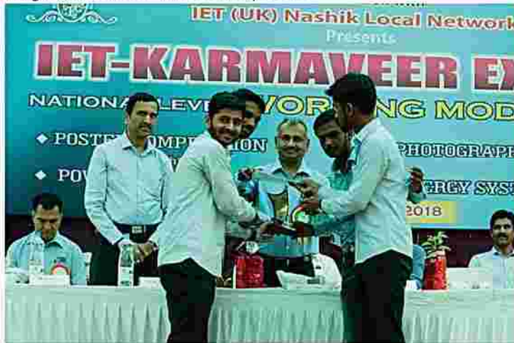
Prize distribution; IET Karmaveer Expo 2018