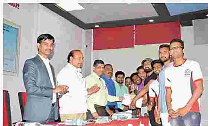
Cricket team won Championship