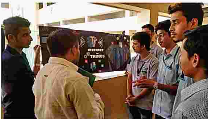
Poster presentation competition for FE