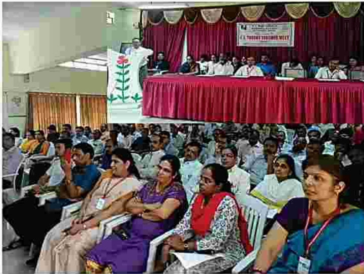
FE Parent Teacher Meet