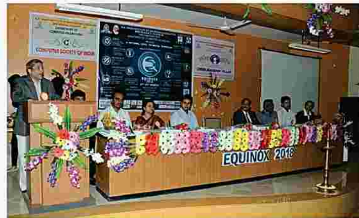
Inauguration of “Equinox 2018”