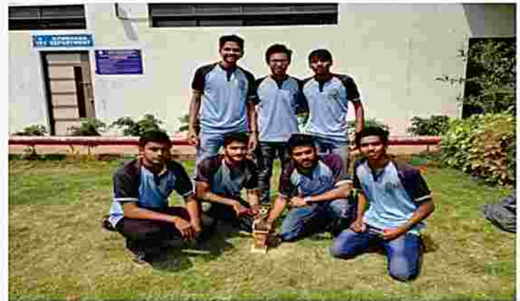
Football team won Championship