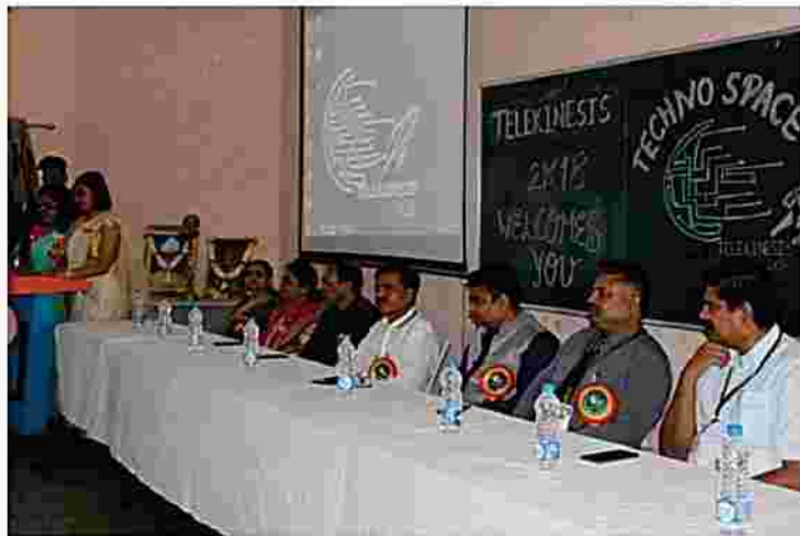
Inauguration function of Telekinesis 2K18