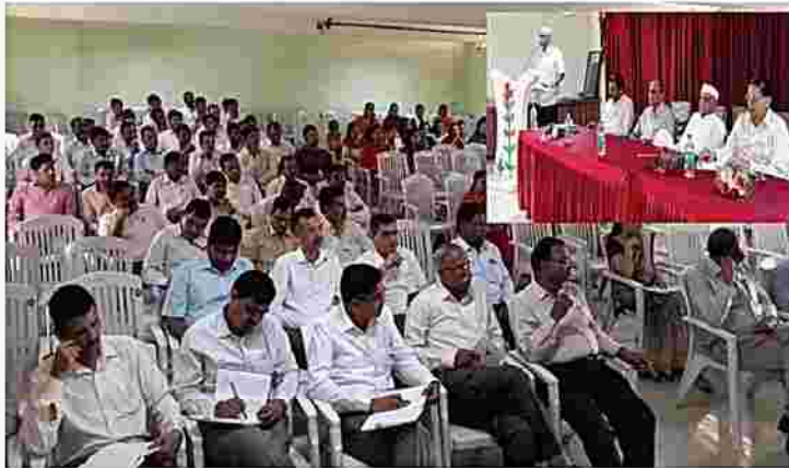
Interaction of Experts