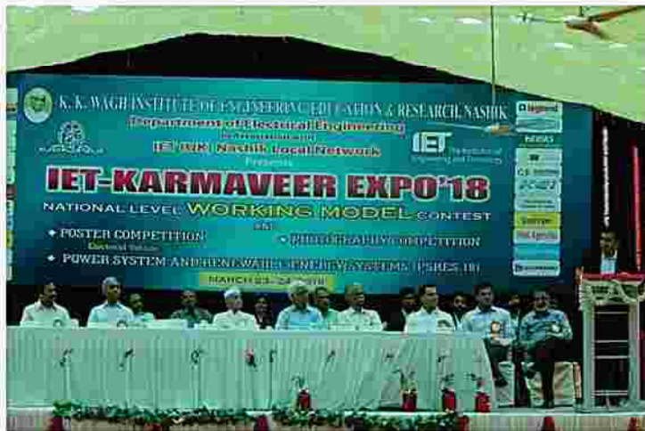
Inauguration of the IET- Karmaveer Expo 2018