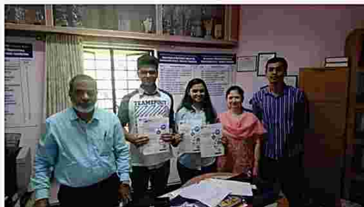
Winners of Present around the World Competition