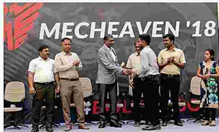
Prize distribution of MECHEAVEN 2018