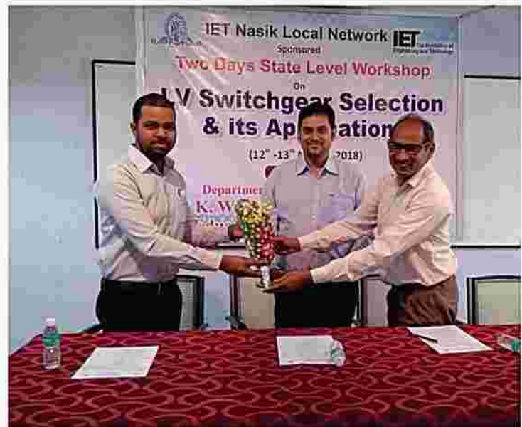
Inauguration LV Switchgear Workshop