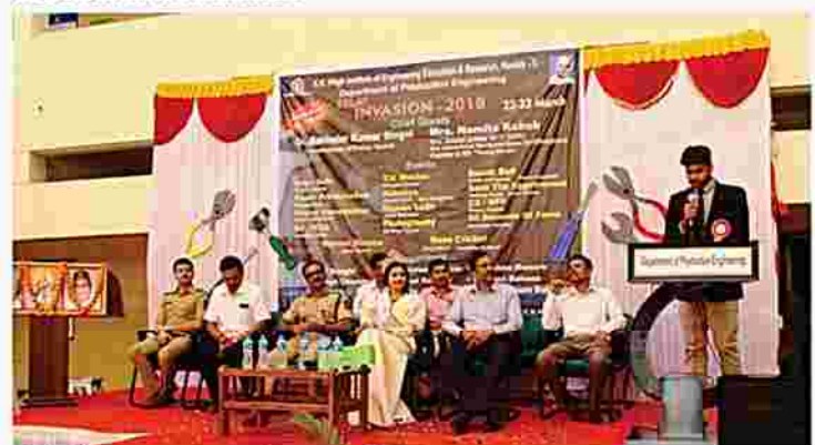
ECLAT Invasion 2018 Inauguration