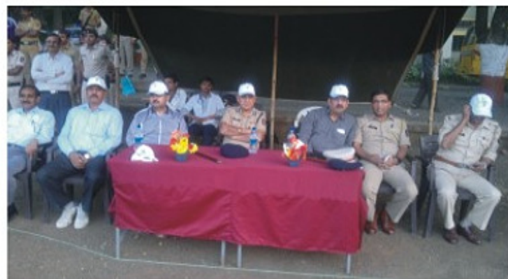
Senior Police Officers present for tournament