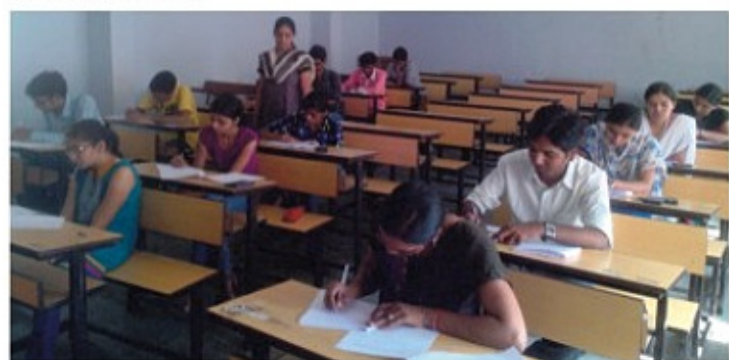
Ramanujan Mathematics Competition

This Institute was Zonal Centre for ISTE Ramanujan Mathematics Competition – Level II. It was organized on 09 th Nov. for Students and Staff members who scored higher marks in the Level-I competition held earlier. Total 11 students of Engineering, 03 students of Diploma and 05 staff members appeared for this level examination.