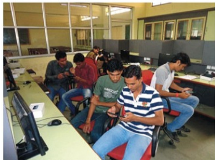
Use of Aakash Tablets by students

Faculty members from Computer Engineering department have started usage of Aakash Tablet for multiple choice questions quiz for the subjects: Database Management System; Advanced Database and C Programming. The response from students is encouraging.