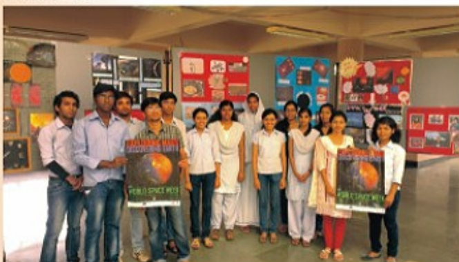
Exhibition of posters by Students

"Kalpana Youth Foundation" the NGO for Space science Education & Outreach, organized World Space week 2013 (04-10 October) in KKWIEE&R on 6 th October 2013. 28 Groups participated in Poster competition on various topics like Moon & Mars Colonies, Mars Exploration Rovers, International Space Station, Earth like planets, Role of women Astronauts and Astronomers and Space Telescopes. This exhibition was attended and visited by more than 800 students. The motive behind this activity is to spread awareness regarding space exploration & latest space related missions amongst the students.