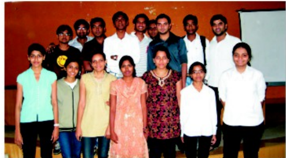
Students from MCA department were qualified for IBM RAD Websphere 6.0.

IBM has conducted 4 Days training on RAD at Computer Engineering Department from 16 th - 18 th September 2012. Online Examination was conducted on 28 th September 2012 in which thirteen students from MCA [TY] and seven students from MCA [SY] were qualified for IBM RAD Websphere 6.0.