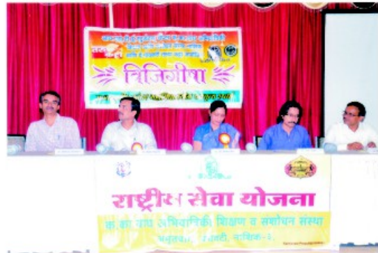
Inauguration of 'Vijigisha - State Level Intercollegiate Elocution Competition' on 28 th Sept. 2012