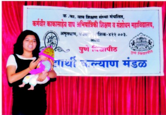
'One Act Play' Competition on topic 'Female Foeticides' was organized by Board of Students' Welfare of the Institute on 27 th September 2012.